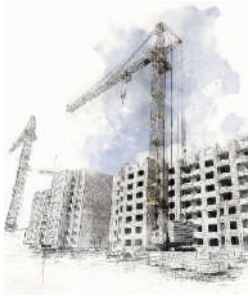
Turn-Key Project Management