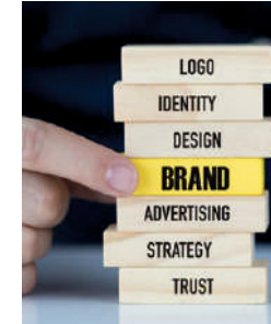
Brand Development & Positioning