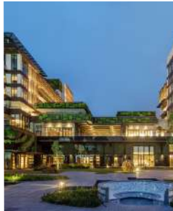
Concept Development and Design